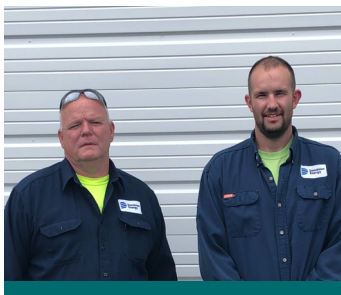
AGA MERITORIOUS SERVICE AWARD